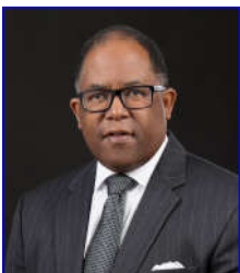
Elected Official of the Year Hon. Mark Ridley-Thomas L.A. County Supervisor and LA Metro Board of Directors