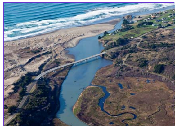
2011 CTF Structure Project of the Year Ten Mile River Bridge Replacement Caltrans D1; Golden State Bridge; California Coastal Commission; Caltrans Division of Engineering Services

Last year 325 people came to the Awards Luncheon to cheer on their favorite finalist. From Bicycle/Pedestrian to Public Outreach and Freeway, CTF recognizes all modes, from all areas of the state, public and private sector. CTF also hosts the Caltrans Manager Awards at the same luncheon. Come join the fun!